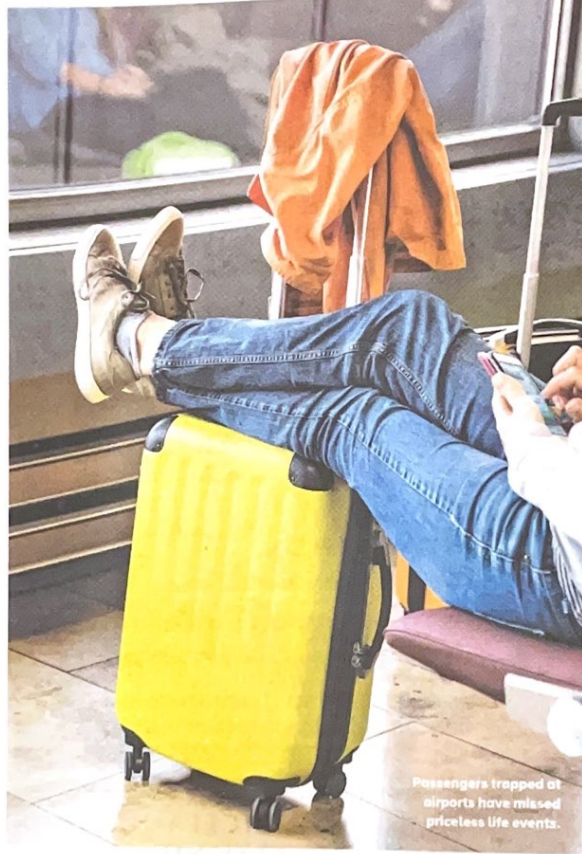
Passengers trapped at airports have missed priceless life events.

He also queries whether airline compensation schemes will provide any real incentive to airlines to minimise delays more than they currently do. "Airlines want to run a tight schedule already," he says. "Some of the commentary seems to be 'they just delay